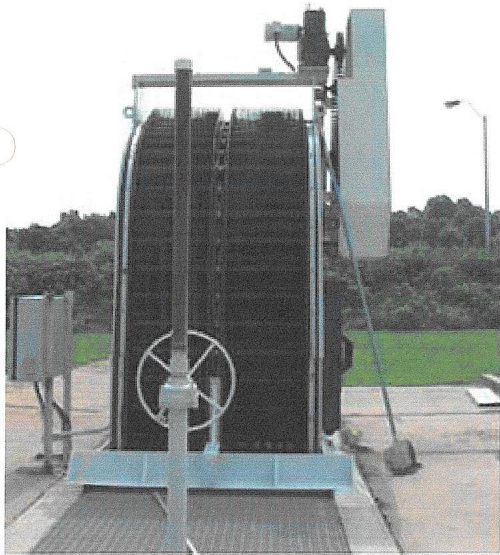
Effluent Screen (Front View)