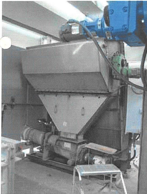
Influent Fine Filter Screen Assembly