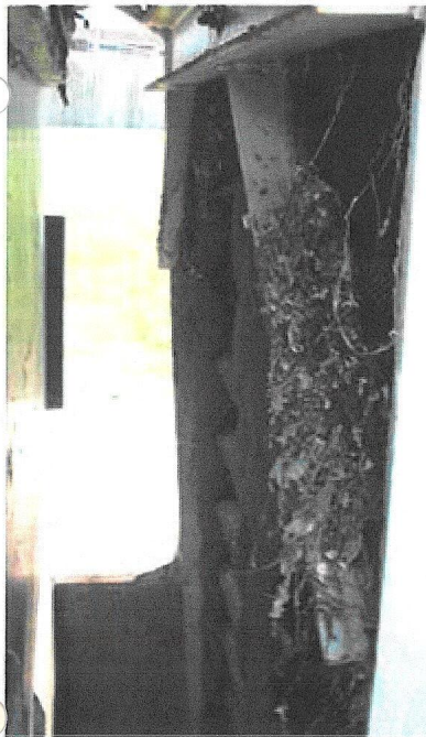
Effluent Screen (Rear View)